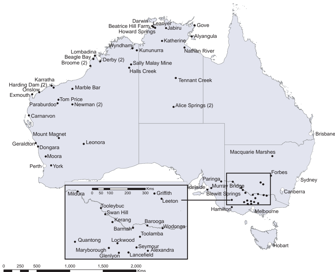
Map: Sentinel chicken testing sites, Australia, 2009–10

Sentinel chicken flocks in the Northern Territory are maintained, bled and analysed for flavivirus antibodies in a combined program between the Northern Territory Department of Health, Centre for Disease